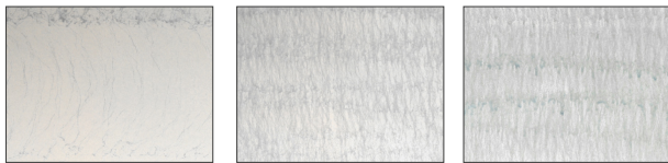
LIGHT COVERAGE MEDIUM COVERAGE HIGH COVERAGE

Coverage for this product is calculated on medium coverage, average 15-20 grams per s/m 2